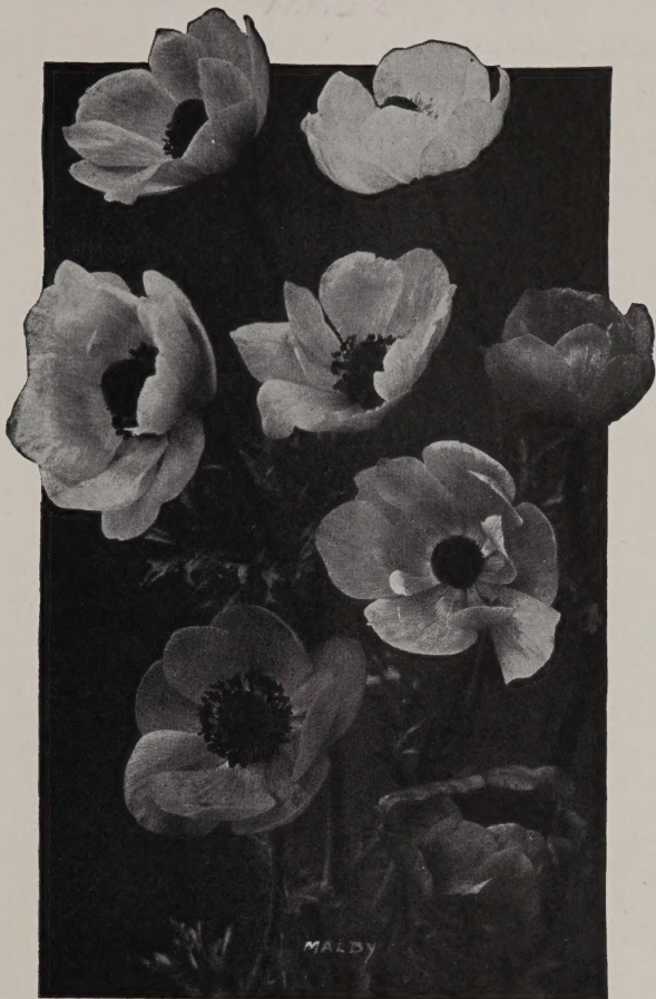
ANEMONES DE CAEN (See Color Plate and Special Offer on Cover)